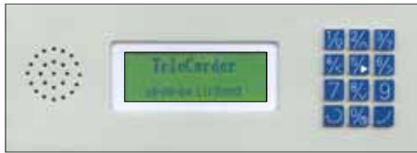
Front with speaker, LCD display, & keypad

Models TC-02F & TC-04F 2 or 4 channels with built-in hard drive