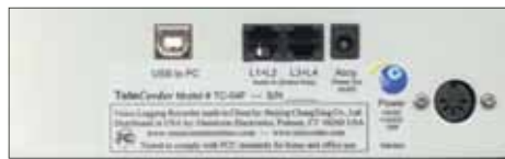
Back with input and output connections