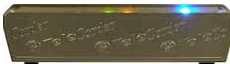
Front with power & channel activity lights

Models UC-02B & UC-04B 2 or 4 channels record to PC hard drive