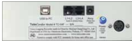
Back with input and output connections