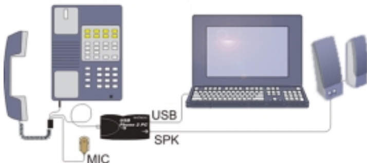
USB Phone 2 PC Interface